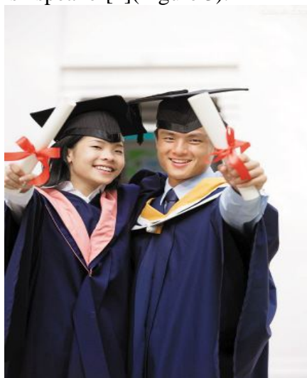
Figure 3 Cultivation of talent

English interpretation ability is an important skill in English teaching, and the level of students' English interpretation ability can also reflect students' English translation ability, so English teaching in higher vocational colleges should pay attention to the cultivation of students' English interpretation ability. Moreover, under the new situation of our country's development, the demand for professional interpretation talents in all walks of life is increasing, so the training of students' English interpretation level should be increased in the course of English teaching in higher vocational colleges. For example, in the process of higher vocational English translation teaching, teachers can prepare some translation questions at any time for students to speak in class. This kind of interpretation connection can not only improve students' translation level, understanding of grammar and application of English skills, but also greatly improve students' ability to adapt to the situation, so as to fully mobilize students' brains, constantly improve students' logical thinking and language organization ability, constantly improve students' English thinking ability and English pragmatic ability, and comprehensively strengthen students' English practical ability. These are all necessary for a professional English speaker[4](Figure 3).