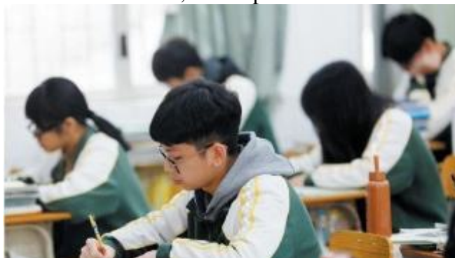
Figure 1 English courses

In the process of reforming the mode of English major education in higher vocational colleges, schools and teachers should make it clear that the construction of talent training goal should be multi-dimensional and multi-level, and its main goal is to cultivate students' English practice ability, stimulate students' innovative consciousness, and improve students' industrial ability (Fig .1).